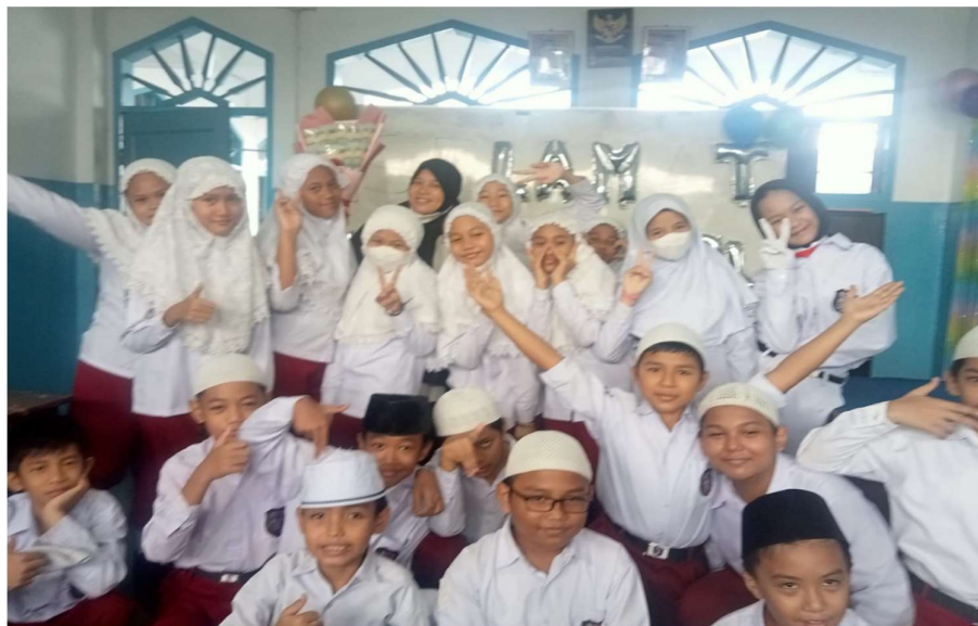
Figure 2. Students' Enthusiasm after Learning with Wattpad

Wattpad is a platform for writer-reader cooperation in addition to being a useful tool for digital literacy. Wattpad gives users an interactive and customized writing and reading experience with features like font changes, comments, voting, sharing, libraries, and playlists. Those who want to publish their literary works online can also do so on this site. As a result, Wattpad has made reading more interesting, encouraged creativity, and engaged students with literature as a digital literacy tool. Wattpad has tremendous promise as a digital literacy tool and can be further developed in an educational setting, despite certain obstacles that must be overcome.