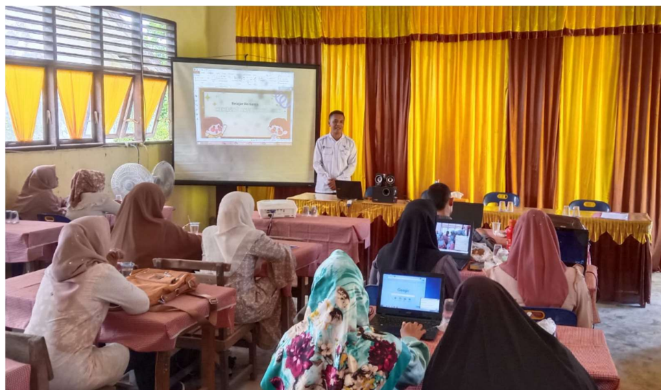
Figure 1. Initial program of community service

In terms of knowledge, the primary lecture on "Why is Literacy Culture Important?" succeeded in establishing a strong theoretical background, helping attendees comprehend the significance of literacy in improving the quality of education. This material also promotes further discussion concerning concrete implementation in everyday life. The literacy exhibition presented during the break provided extra insight into students' inventiveness in expressing themselves via diverse literacy works. This exhibition is vivid evidence of the potential that students have in strengthening their reading abilities.