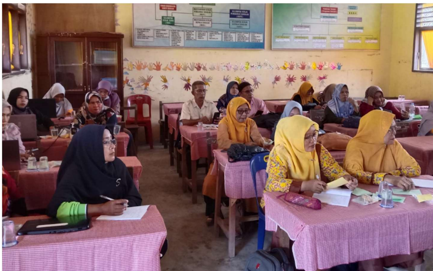
Figure 2. Participant of the seminar

Furthermore, in-depth review and monitoring of the implementation of the action plans created by the participants will be an important step. This will assist assess the extent to which the ideas and techniques generated at the seminar can be implemented effectively in the educational context. Continuous commitment from all parties involved, including schools, instructors, students and parents, is crucial in preserving the sustainability of this good development. Thus, the results of this community activity represent the beginning of a major change in literacy growth at Tanah Merah State Elementary School. Hopefully the passion and awareness established in this activity can continue to grow and motivate meaningful action towards promoting literacy at the school and local community level.