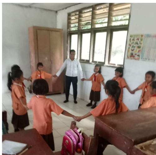
Figure 2. Ice Breaking in Post Activity

This pleasant experience also opens up opportunities to encourage connected parties, including health authorities and community organizations, to collaboratively support efforts to maintain cleanliness in educational environments. It is envisaged that this cross-sector collaboration can produce a better and more sustainable impact. With the success of this community activity, we hope it can be an inspiration for other parties to contribute to enhancing health and cleanliness in the school environment and the wider community. Thank you for the support and participation of all parties who have made this activity a success. We believe that our collaborative efforts can make a real positive impact to future generations and the health of society as a whole.