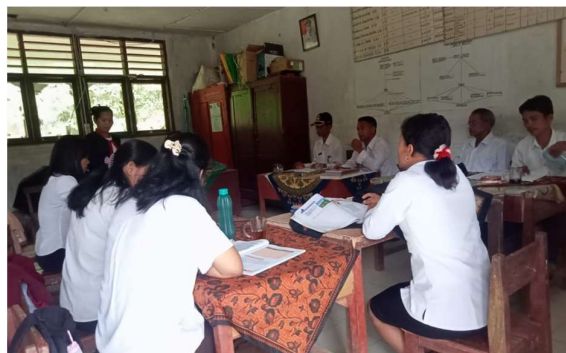
Figure 1. Initial Meeting of the Community Service

The findings and discussion of these community service activities are highly significant for analyzing the impact that has been accomplished and designing sustainable measures. Through this activity, we measure the increase in understanding and awareness about hand washing behaviors among students, teachers and school staff. Surveys before and after the exercise demonstrated a considerable increase in practical knowledge of correct hand washing practices and understanding of its benefits. Conversations in the question and answer session and group conversations addressed the issues and obstacles faced by participants in implementing hand washing practices. From these results, we may design a more specialized solution that matches the needs of the 173622 Sipagabu State Elementary School community. In addition, active involvement in workshop sessions and practical demonstrations revealed that the interactive method was more effective in gaining practical abilities.