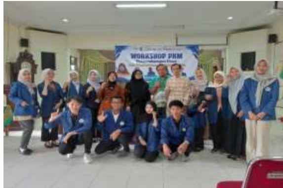
Figure 2: Photo of the Implementation of the Indonesian Language-Friendly Village Workshop in Belangwetan, Klaten.