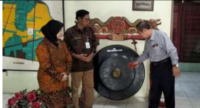
Figure 1 Inauguration of the Indonesian Language-Friendly Village in Belangwetan, Klaten

The growth of culinary businesses in Belangwetan village has attracted visitors from outside the village, especially in the mornings when parents are busy preparing food for their children. Belangwetan village, a priority village in North Klaten district, boasts a rich local culture and significant community potential, including culinary businesses, afternoon tutoring, and furniture businesses, all of which require technological innovation for marketing. However, there is no systematic and innovative literacy program, specifically Indonesian language literacy, based on technology and local wisdom to address this issue.