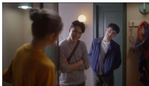
Picture 7. Meeting with friends

Productivity in learning or work activities is often considered a measure of success in achieving goals, be it academic or professional. However, the pressure to be constantly productive without regard to physical and mental limits can lead to fatigue that adversely affects health. This can be seen in the image above of the woman's face as she is shown forcing herself to work or study for long periods of time without adequate rest, physical fatigue such as body weakness and headaches often appears, accompanied by mental fatigue characterized by stress, loss of concentration, and decreased motivation.