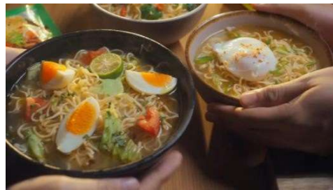
Picture 11. Indomie soup

Togetherness is represented as a relaxed moment full of laughter, where three people gather around a table while talking and sharing happiness. The presence of Indomie products on the table confirms that food can be the center of attention that binds social interaction. Through symbols such as laughter, smiles, and shared activities, this image reflects the meaning that togetherness is about enjoying simple yet precious time with those closest to you. Indomie is presented not only as food, but also as a medium that supports the creation of an intimate and warm atmosphere. This reflects the universal value that being together with friends or family is often filled with activities that evoke positive memories, such as cooking or eating together.