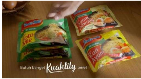
Picture 8. Various taste of Indomie

In scene 8, Denotation: Displaying Indomie instant noodle products with flavors such as Soto Mie, Ayam Bawang, and Chicken Curry placed on a wooden table. At the bottom, there is an inscription “Really need Kuahlity time!” which emphasizes the quality of the product. Connotation: This advertisement utilizes visual and verbal elements to create an emotional association between the product and the moment of togetherness. The word “ Kuahlity ” is a play on words between “quality” and “soup,” leading the audience to images of deliciousness and comfort. This element shows how the product is not only positioned as food, but also a symbol of happiness and relaxation. Myths: Enjoying Indomie is part of a modern lifestyle that is practical and fun.