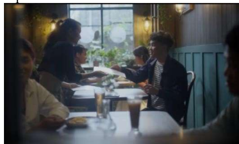
Figure 2. Situation at the café

Wooden shelves with warm lights are usually used to beautify items placed on wooden shelves. The Indomie display on this shelf is shown in Dinda's house, to show the aesthetics of Indomie products that give an elegant and neat impression.