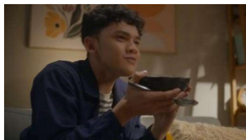
Picture 12. A man is eating Indomie

In the context of the advertisement, Indomie is positioned as the perfect choice for creating quality time (kuahlity time). Elements such as warm soup, fresh ingredients, and hands holding the bowl reinforce the message that this food is not only practical, but also has emotional value, creating comfort and simple happiness in everyday life.