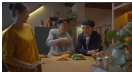
Picture 10. Talking with friends

In modern culture, such moments are often associated with a sense of nostalgia, gratitude, and simple satisfaction. The presence of women in a central position can also symbolize a loving figure or the “keeper of harmony” in a family or group, in line with traditional values of food as the glue of relationships between individuals.