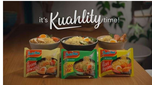
Picture 16. Variant of Indomie soup

This image confirms Indomie's position as not only a food product, but also as a connecting medium that brings emotional experience, warmth, and happiness in everyday moments.