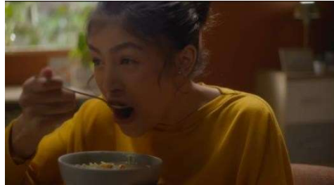
Picture 13. A woman is eating Indomie

Indomie soup can be a solace or a friend in times of leisure, especially in the warm and familiar atmosphere of home. The narrative reflects modern cultural values where happiness is often associated with small but meaningful moments, such as enjoying a warm bowl of food that brings a sense of contentment and nostalgia.