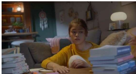
Picture 6. A woman in the living room

In friendship etiquette, a situation where one has been waiting at a cafe, but the expected friend cannot make it should be managed with mutual respect and understanding. As the party who could not make it, it is important to immediately inform the waiting friend with an honest explanation and sincere apology. This shows a sense of responsibility and respect for the friend's time that has been set aside for the meeting.