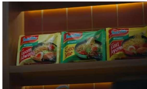
Figure 1. Indomie on a wooden shelf

The research topic to be researched is a 30-second Indomie advertisement entitled “ Bareng Indomie Kuah, Kuahlity Time Gak Tergantikan ” uploaded on You Tube on June 13, 2024. There were 16 (sixteen) scenes on the YouTube advertisement. This advertisement tells about a friendship of three people (a woman and two men) who hold a meeting at a restaurant. The next scene, there are two people who cannot attend because they still have their own busy lives such as doing assignments and working. The next scene an idea arises from one of the people to meet at Dinda's house, the scene at Dinda's house they enjoy Indomie Kuah noodle dishes and spend time together. This advertisement shows togetherness and supporting each other when life is hard. It shows togetherness with the closest people by eating Indomie Kuah together which makes the moment even more irreplaceable. After conducting the process of finding the data, the scenes were analysed using semiotic theory by Roland Barthes for denotative, connotative, and myths meaning.