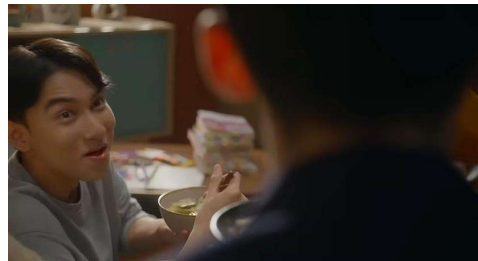
Picture 14. A man is eating Indomie

In modern culture, this moment symbolizes the small satisfactions of everyday life—a precious time to treat yourself to something simple yet satisfying. This woman represents consumers who are comfortable and satisfied with convenient food options that are still of high quality.