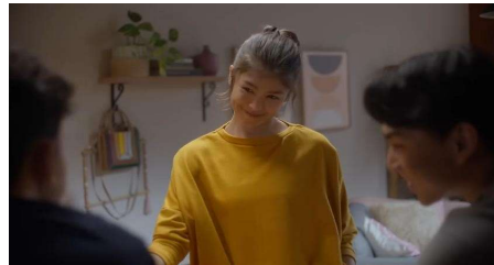
Picture 9. The woman smiles at her friends

The advertisement “ Indomie Kuah, Kuahlity Time Gak Tergantikan ” uses the concept that enjoying Indomie kuah is not just about consuming food, but about creating a special moment that cannot be replaced by anything. In the context of the image above, this is reinforced by visual elements in the form of Indomie packaging with various flavors such as Soto Mie , Ayam Bawang , and Chicken Curry which are synonymous with warm and appetizing flavors. Semiotically, visual elements such as a simple wooden table and a hand that is ready to take one of the Indomie packs indicate a casual, homey, and warm atmosphere.