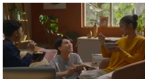
Picture 15. A group of friends

This image conveys the message of simple happiness that comes through togetherness and affordable food like Indomie. With the cheerful expression of a young man holding a bowl, and the relaxed atmosphere in the room, this image illustrates how eating is not only a physical activity but also a social experience that strengthens relationships between individuals.