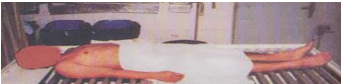
Figure 1. Covering the Corpse's Private Parts

It is recommended to cover the deceased's private parts when bathing the body and remove their clothing, ensuring that they are covered from the view of others. This is because the deceased may be in a condition that is inappropriate to be seen. The board where the body is placed should be slightly tilted towards the deceased's feet to allow water and any impurities to flow easily from the body.