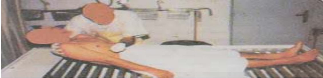
Figure 2. Process of Cleaning Dirt.

The person assigned to bathe the body begins by softening the deceased's joints. If the deceased's nails are long, they should be trimmed. Similarly, the armpit hair should be removed. As for the pubic hair, it should not be touched as it is considered a major private part (awrah). Then, the person bathing the body lifts the deceased's head until it is almost in a sitting position. Next, they gently massage the abdomen to expel any remaining impurities in the stomach. It is important to pour plenty of water to cleanse the impurities that are released.