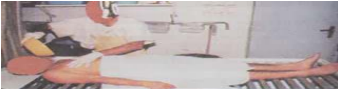
Figure 3. Washing the Body of a Dead Body

The person assigned to bathe the body begins by softening the deceased's joints. If the deceased's nails are long, they should be trimmed. Similarly, the armpit hair should be removed. As for the pubic hair, it should not be touched as it is considered a major private part (awrah). Then, the person bathing the body lifts the deceased's head until it is almost in a sitting position. Next, they gently massage the abdomen to expel any remaining impurities in the stomach. It is important to pour plenty of water to cleanse the impurities that are released.