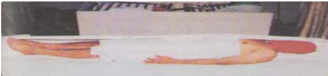
Figure 4. Shrouding a corpse

After that, the right side of the deceased's body should be washed, starting from the right side of the neck, then the right hand and right shoulder, followed by the right side of the chest, then the right side of the body, and finally the right thigh, calf, and right foot.