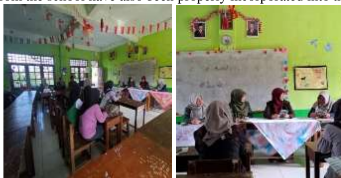
Figure 5. Collaborative Content Review

Figure 4 showcases the brochure design for Al-Amalul Khoir School created by the Polsri community service team. The brochure was designed using Canva.com application to achieve a proportional and appealing layout. The design process involved determining the brochure content and selecting visual components that enhance its appeal, ensuring the final product is both informative and engaging for readers. The Polsri team maintained consistent communication with the school regarding the brochure content, as this represents the school's identity that will be widely distributed to the public. Several suggestions from the school have also been properly incorporated into the design.