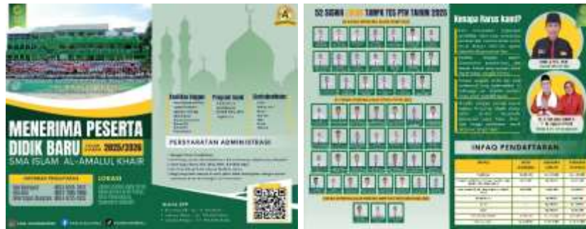
Figure 6. Final Design of the Al-Amalul Khoir Senior High School New Student Admission Brochure

Figure 6 presents the final design of the new student admission brochure for Al-Amalul Khoir Senior High School. This finalized design, which had undergone prior review by the school, was subsequently produced as a printed sample. Additionally, the digital file was formally delivered to the school administration via WhatsApp.