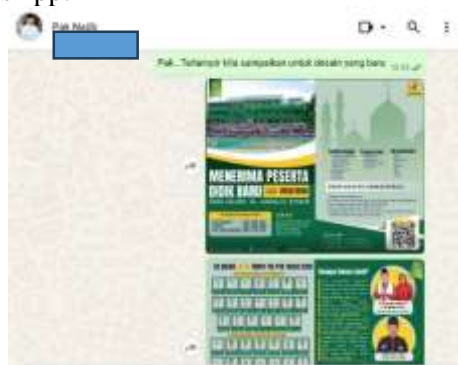
Figure 7. Release the Brochure and Symbolic Handover

Figure 6 presents the final design of the new student admission brochure for Al-Amalul Khoir Senior High School. This finalized design, which had undergone prior review by the school, was subsequently produced as a printed sample. Additionally, the digital file was formally delivered to the school administration via WhatsApp.