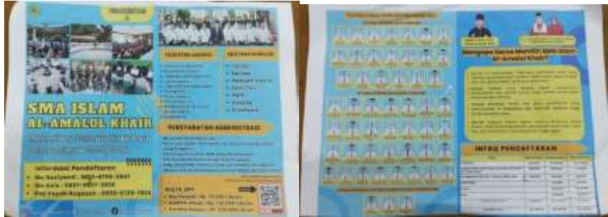
Figure 1. Al-Amalul Khair High School New Student Admission Brochure, 2024

accessible digital platforms. One such example can be seen in the high school brochure, as illustrated in the image below.